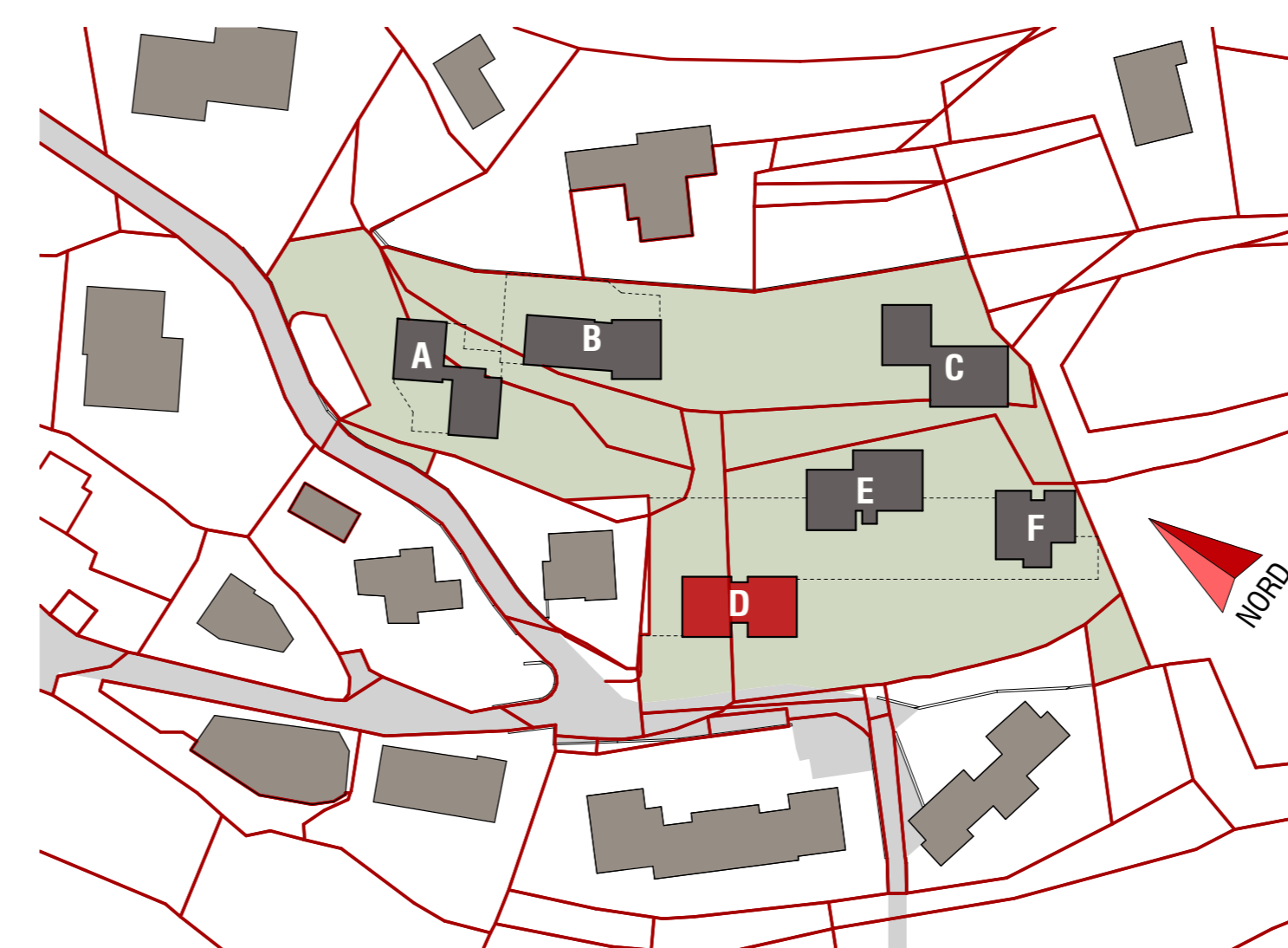
INQUADRAMENTO FABBRICATI 1 : 1000