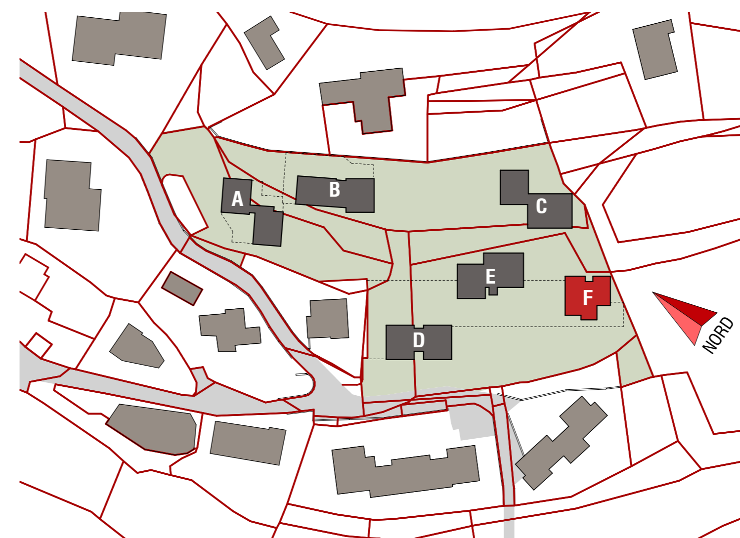
INQUADRAMENTO FABBRICATI 1 : 1000